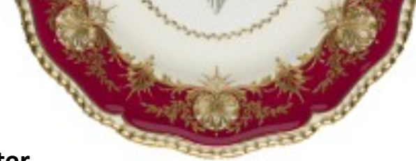
Plate Design Challenge with The Museum of Royal Worcester

For 250 years, Worcester factories made beautiful china for people's homes. They made everything you can think of that could be made from porcelain, including umbrella stands, cups and saucers, vases and plates (lots and lots of plates!). It was a designer's job to choose how the plates looked, and they had lots of inspiration from books and beautiful pictures held in the factory's design library .